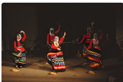
Farima Spring Dance

The historic site of Montalvo Arts Center serves as a hub for art and culture in the community, with a mission to enrich people's lives, spark necessary conversations, and inspire creativity. Come join us on a guided outdoor tour through our sculpture-filled grounds, Italianate garden, and artist residency studios. Field trips are approximately 45 minutes to 1 hour, and can be customized to your classroom and students' needs.