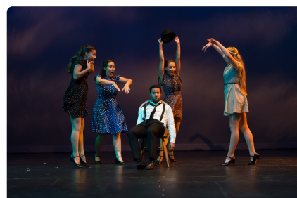
New Ground Dance